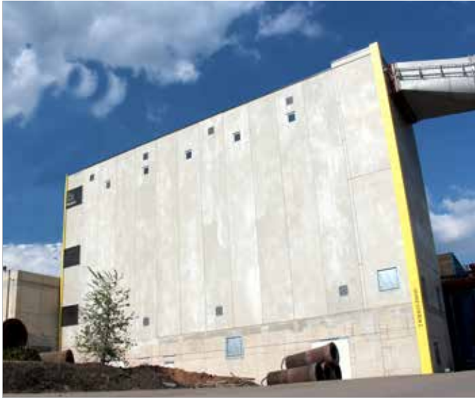
Zeron, 1.300.000 Bm 3 /h, Reference picture